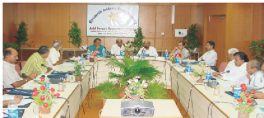
The second meeting of the steering committee at AFRI, Jodhpur

MAB International dry land Eco-system workshop” was held at AFRI, Jodhpur on 27th September 2007.