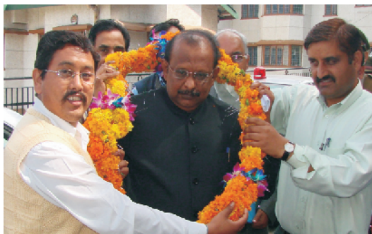
Welcome of Hon'ble Minister by staff of HFRI , Shimla