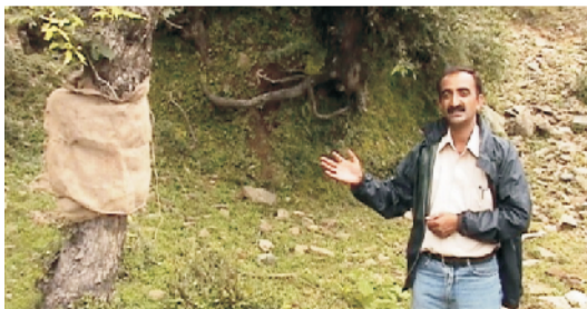
Field demonstration of Burlap Trap at HFRI, Shimla

HFRI, Shimla conducted training on the "Insect Pests of Ban Oak and Management of Defoliators" on 12th September 2007, in the "Block Resource Coordination Center (BRCC) for Sarva Shiksha Abiyan (SSA)" at Sarahan, of Sirmour district, Himachal Pradesh. There were 40 trainees including foresters, villagers, farmers, school teachers, school students (+10 standard) as well as 3 instructors of BRC, CSSA.