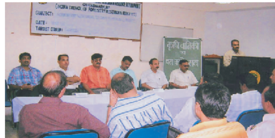
Training on "Agroforestry with special reference to medicinal plants at Chhindwara

Centre for Forestry Research and Human Resource Development (CFRHRD), Chhindwara conducted a one-day training programme on "Agroforestry with special reference to medicinal plants" on 10th July 2007. Twenty five participants attended the training programme.