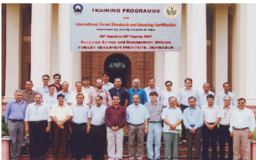
Training on "International Forest Standards and Securing Certification" at FRI, Dehradun