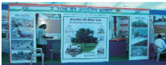
Exhibition at Gaushala Maidan, Jodhpur

AFRI, Jodhpur organized an exhibition “Sanskriti-Sarokar and Sankalp” in Gaushala maidan, arranged by Jodhpur district administration on the occasion of 60th Independence day celebrations in Jodhpur, from 13th to 16th August 2007. The exhibition was inaugurated on 13th August by Smt. Vasundhara Raje, the Hon'ble Chief Minister of Rajasthan. The Institute exhibited various research findings/works in the exhibition. Two models depicting the natural sand drift conditions and bio-drainage were displayed in the stall. Brochures on medicinal plants, food from forests etc. were distributed in the exhibition.