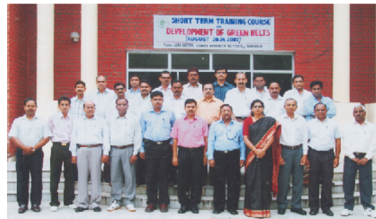
Short-term training course on "Development of Green Belt" at FRI, Dehradun

FRI, Dehradun organized a short-term training course on "Development of Green Belt" from 20th to 24th August 2007. The participants were from ACC Cement, KRIBHCO, IFFCO, NABARD, Tata Steel, Orissa State Pollution Control Board, DVC, Punjab and Uttarakhand Forest Departments, APGENCO, BPCL Mumbai and Numaligarh (Assam), NTPC, Maharashtra Industrial Development Corporation, THDLC.