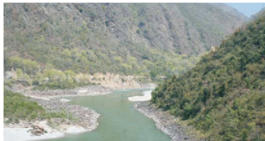
Proposed dam site for Kotlibhel hydroelectric project

ICFRE completed two consultancy projects on Environmental Impact Assessment (EIA) studies and formulation of Environmental Management Plan (EMP) for (1) Kotlibhel Hydroelectric Project stage II (530 MW), National Hydroelectric Power Corporation Ltd., Tehri and Pauri Garhwal and (2) Catchment Area Treatment Plan studies for exploitation of bauxite deposits in Galikonda, Rakthakonda and Chittamgondi of Visakhapatanam district awarded by Andhra Pradesh Mineral Development Corporation Ltd. (APMDC), Hyderabad.