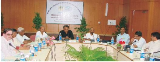
One-day Regional Workshop on "Forestry Statistics" at AFRI, Jodhpur

AFRI, Jodhpur organized a one-day regional workshop on "Forestry Statistics" at AFRI on 18th September 2007 under the ICFRE-ITTO project with the aim to sensitize the agencies and at the same time to get the feedback from the SFDs regarding problems being faced in collection, compiling and sending the required data on these formats.