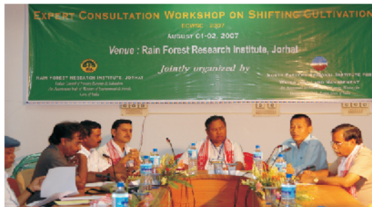
Inaugural session of workshop on shifting cultivation

Rain Forest Research Institute (RFRI), Jorhat organized two days' Expert Consultation Workshop on “Shifting Cultivation” on 1 st and 2 nd August 2007 in collaboration with North Eastern Regional Institute of Water and Land Management (NERIWALM), Tezpur, Assam.