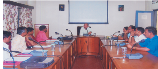
Short-term training at IWST, Bangalore

IWST, Bangalore organized a short-term training on "Wood Protection (Seasoning, Preservation and Biodegradation)" from 20th