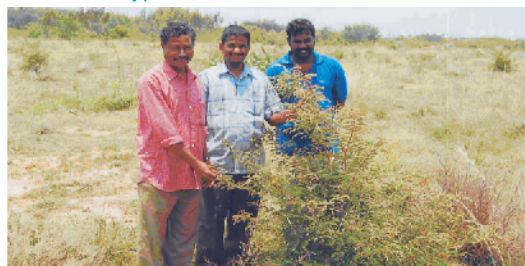
Full sib trial of Tamarindus indica at Kolapakkam (Tamil Nadu)

livelihood of the arid and semi-arid regions. Usually tamarind produces fruits that contain brown colour pulp. There exists red tamarind, a natural intra specific variant, having rich anthocyanin content in their fruits and stems that are of potential use in food colour industry. In natural conditions red tamarinds occur very rarely. With the support of Tamil Nadu Forest Department, an initiative was made to combine the red variant with brown pulp tamarind. In Tamil Nadu there are about 40 regular high pulp yielding selections.