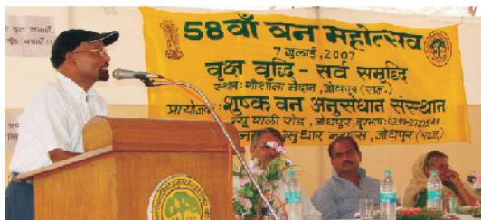
58 th Van Mahotsava at Gaushala Maidan, Jodhpur