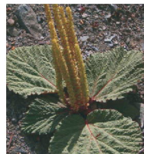
Rheum moorcroftianum Royle

It is distributed from Himachal Pradesh to Nepal between 3600-4700 m above mean sea level. During floristic survey in the state of Himachal Pradesh the plant has been found in open slopes in drier areas of Giavung Valley in cold desert of district Kinnaur (Himachal Pradesh) between