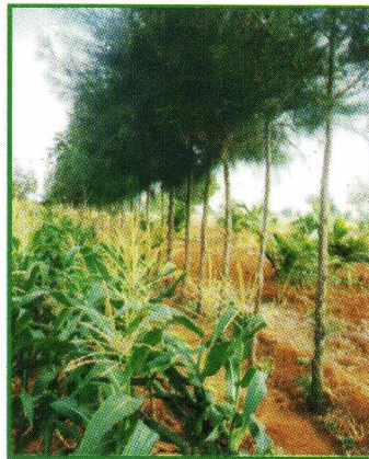
Casuarina - Maize Model

This term is used to denote combinations of trees and agricultural crops on the same unit of land in some form of spatial mixture or sequence.