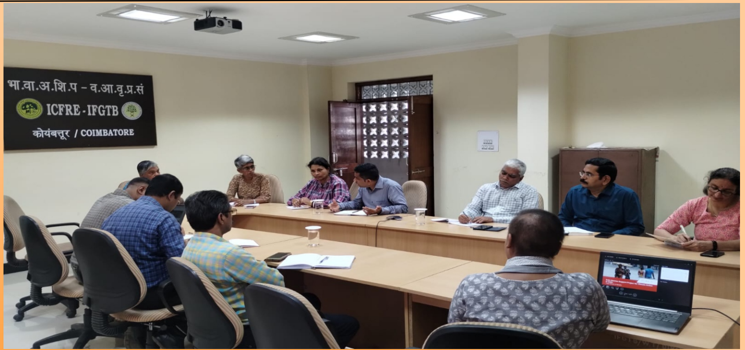
Workshop on “Carbon Sequestration Potential on Urban Forest- Consultant from GIZ, under Indo German Support Project on Climate Change action in India ” by ICFRE-IFGTB, Coimbatore