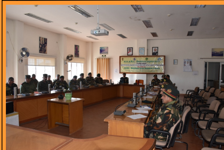
Training on “Forestry Practices” by ICFRE-HFRI, Shimla