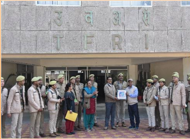
Visit of FRO from Uttarakhand Forest Academy, Haldwani at ICFRE-TFRI, Jabalpur