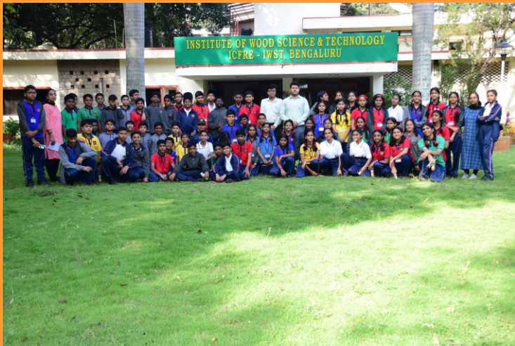
Visit of students from PM Shri Kendriya Vidyalaya, Malleshwaram to ICFRE-IWST, Bengaluru