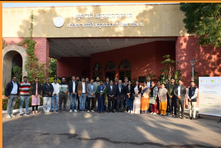
Training on “Sustainable Forestry Conservation and Ecological Aspects of Dry Areas ” by ICFRE-AFRI, Jodhpur