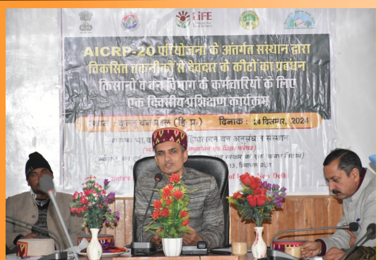
Training on “Management of Insect pests of Deodar and Shisham” by ICFRE-HFRI, Shimla