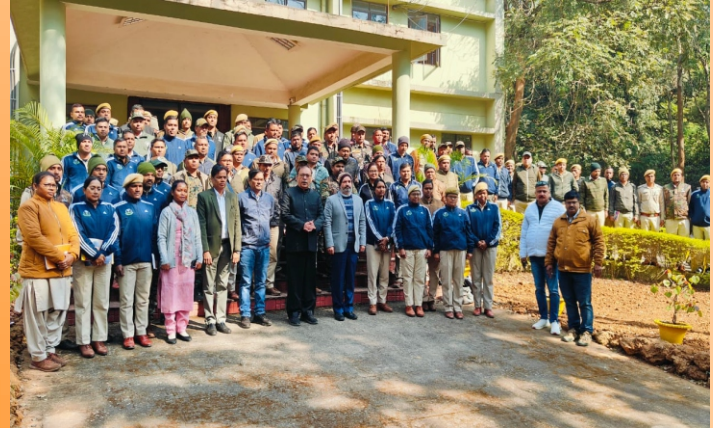
Visit of Forest Guards from State Forest Training Institute, Mahilong at ICFRE-IFP, Ranchi