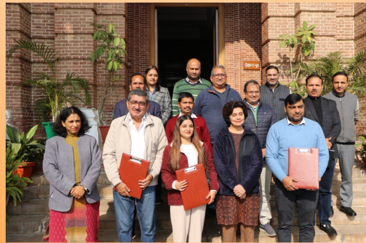
Signing of MoU between ICFRE-FRI, Dehradun and M/S Eco Harvest Carbon Alliance, Kanpur, M/S Bindra Agro, Shamli and M/S Beej Tech Growery, Meerut