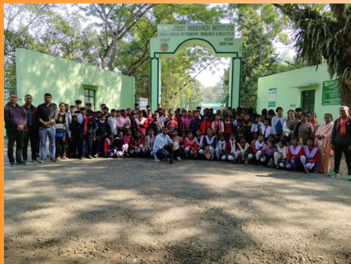
Visit of students from Fechual Jayshree High School, Jorhat to ICFRE-RFRI, Jorhat