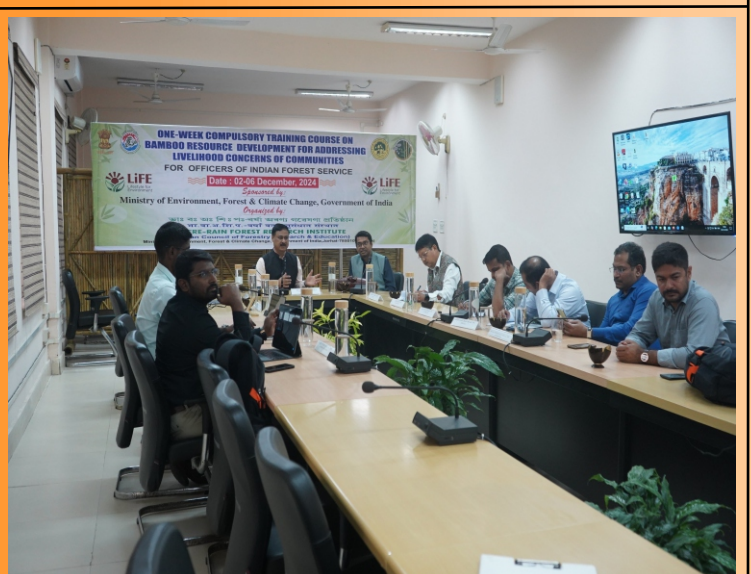
Training on “Bamboo Resources Development for Addressing Livelihood Concerns of Communities ” by ICFRE-RFRI, Jorhat