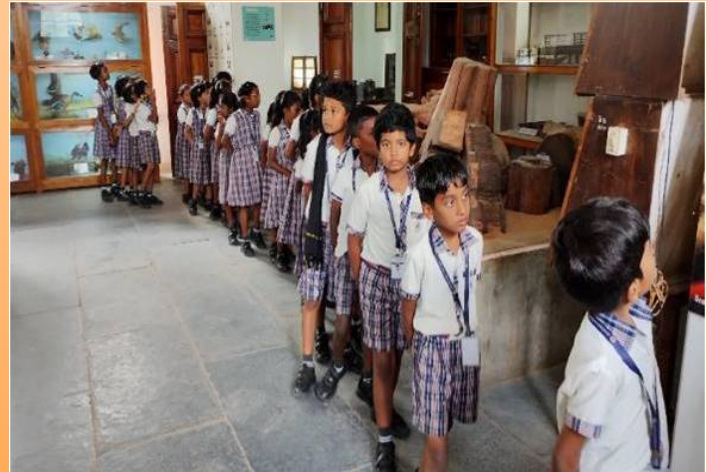
Visit of students from Vidhya Vikasini Matriculation HSC, School, Coimbatore to ICFRE-IFGTB, Coimbatore

transformation, Environmental Protection and Recycling of waste materials and its benefits were delivered to students.