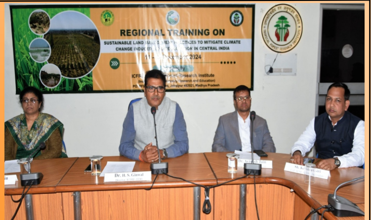
Training on “ Sustainable Land Management (SLM) Practices to Mitigate Climate Change Induced Land Degradation in Central India” by ICFRE-TFRI, Jabalpur