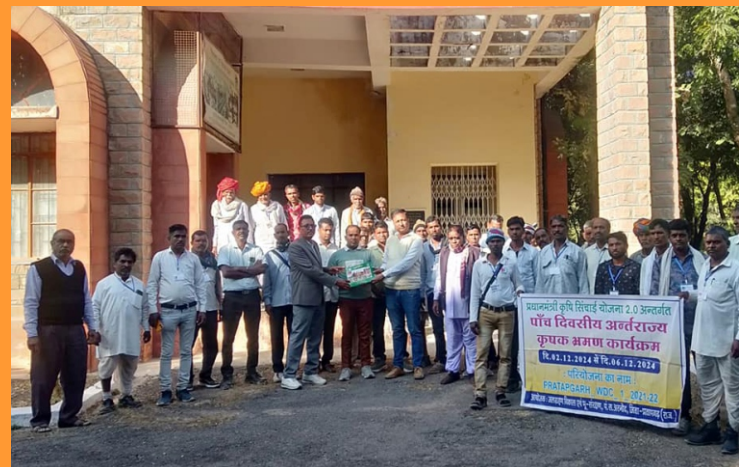
Farmers from Watershed Development and Soil Conservation Department, Pratapgarh, Rajasthan visited ICFRE-AFRI, Jodhpur