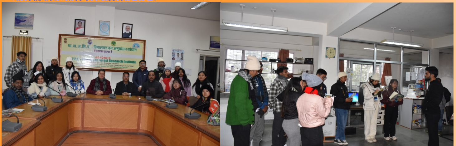
Visit of students from North Eastern Regional Institute of Science and Technology, Itanagar, Arunachal Pradesh at ICFRE-HFRI, Shimla