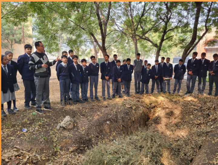
Visit of students from Career Point World School, Jodhpur to ICFRE-AFRI, Jodhpur