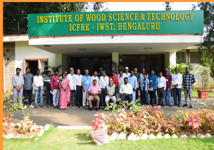
25 farmer s from Krishi Vigyan Kendra, Kaneri Kolhapur visited ICFRE-IWST, Bengaluru