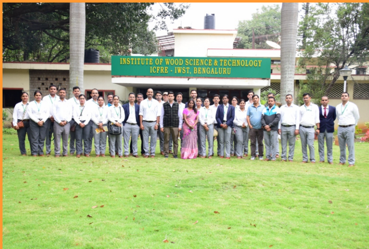
RFO from Himachal Pradesh Forest Academy, Sundarnagar, Himachal Pradesh visited ICFRE-IWST, Bengaluru