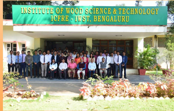
IFS probationers from IGNEA, Dehradun visited ICFRE-IWST, Bengaluru