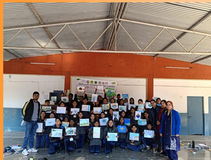
International Mountain Day celebrated by ICFRE-FRI, Dehradun