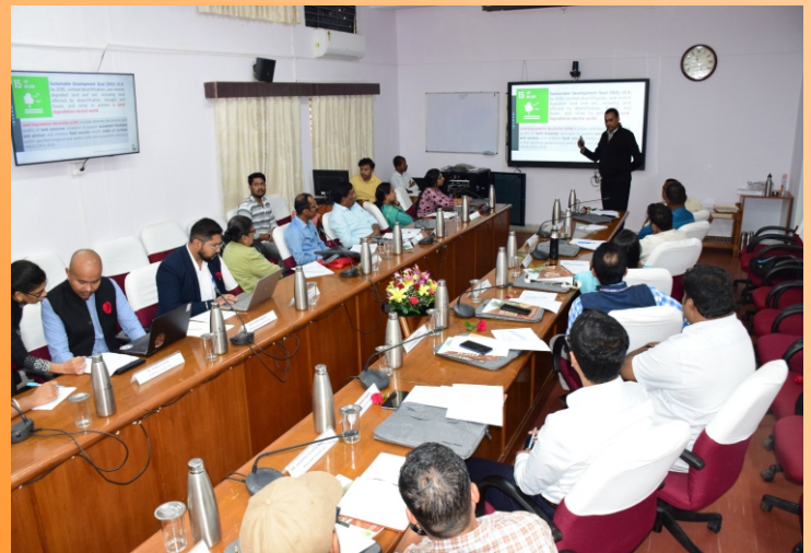
Training on “Sustainable Land Management ” by ICFRE- IWST, Bengaluru