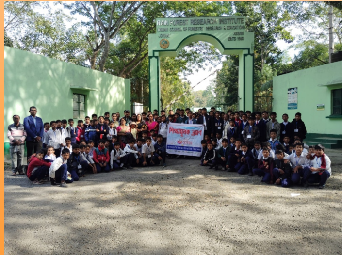
Visit of students from Kuralguri H S School, Golaghat and PM Shri KV No.1, Jorhat to ICFRE-RFRI, Jorhat

MV School, Sarojini Devi Blika Uchhatar Madhyamik Vidyalaya, Jorhat and Samaguria Rajamoidam M E School, Sivasagar and Padma Ram Sarma H. S. School, Madhapur, Titabar, Jorhat and Deepjyoti Model School, Haluating, Sivasagar visited ICFRE-RFRI, Jorhat on 06 th , 09 th , 12 th , 13 th , 17 th , 18 th , 19 th , 20 th , 24 th , 27 th & 30 th December 2024. They were briefed about various research activities of the institute.