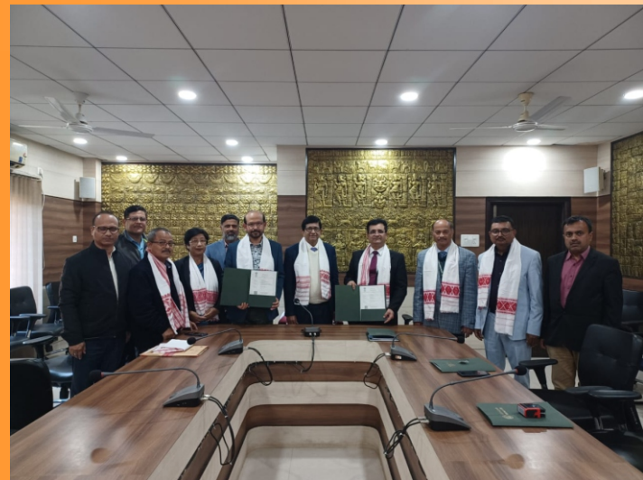
MoU signed between ICFRE-RFRI, Jorhat and Dibrugarh University, Assam