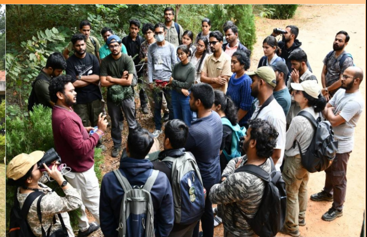
Training on “Documentation and Management of habitat trees” by ICFRE-IFB, Hyderabad