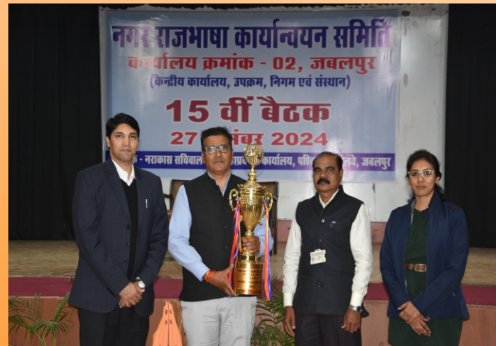
ICFRE-TFRI, Jabalpur was awarded 1 st prize for excellent performance in Hindi Rajbhasha