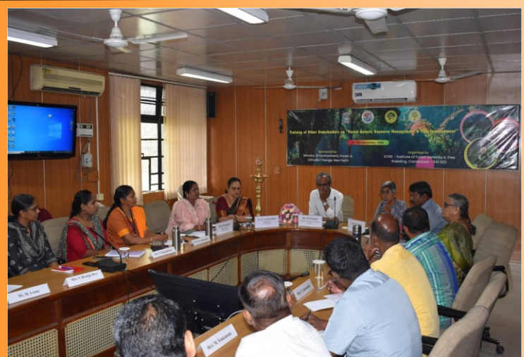
Training on “Tissue culture lab establishment” by ICFRE-IFGTB, Coimbatore