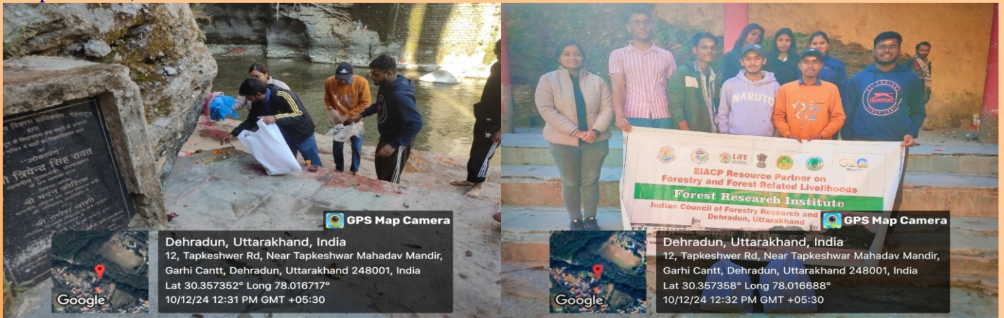
Plogging at Tamsa River Ghats Tapkeshwar, Dehradun