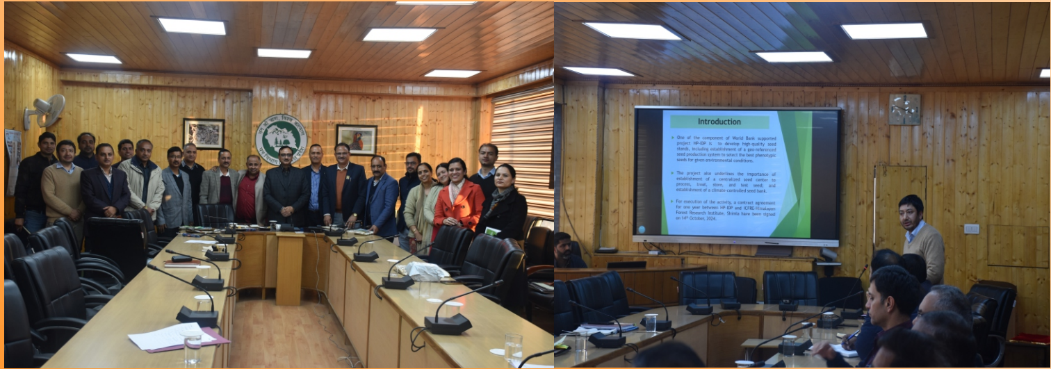
Workshop on “Forest Seed Management through Identification and Development of High-Quality Seed Production Area and Plus Trees of important Multi-Purpose Plantation Species in Himachal Pradesh” by ICFRE-HFRI, Shimla