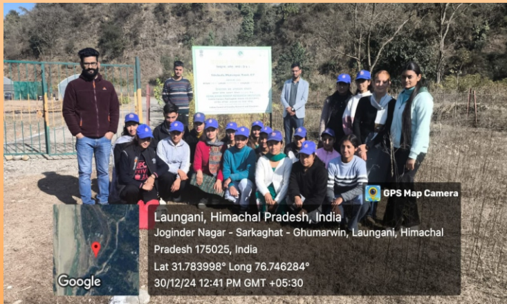
Visit of students from Govt. PG College, Dharampur, Mandi to Shividwala Nursery, VVK, Dharampur