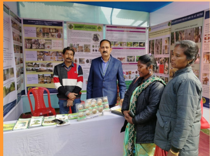
Stall by ICFRE-RFRI, Jorhat in “Kisan Mela” at Kaliapani Changmai Gaon, Teok, Assam