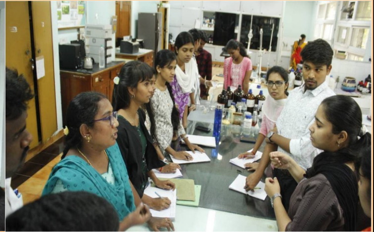
Training on “HPLC:Instrumentation, Principle and Function” by ICFRE-IFGTB, Coimbatore