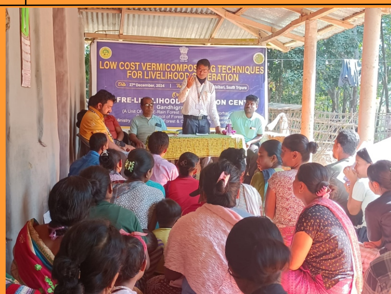
Training on “Low Cost Vermicomposting techniques for Livelihood generation ” by ICFRE-RFRI, Jorhat