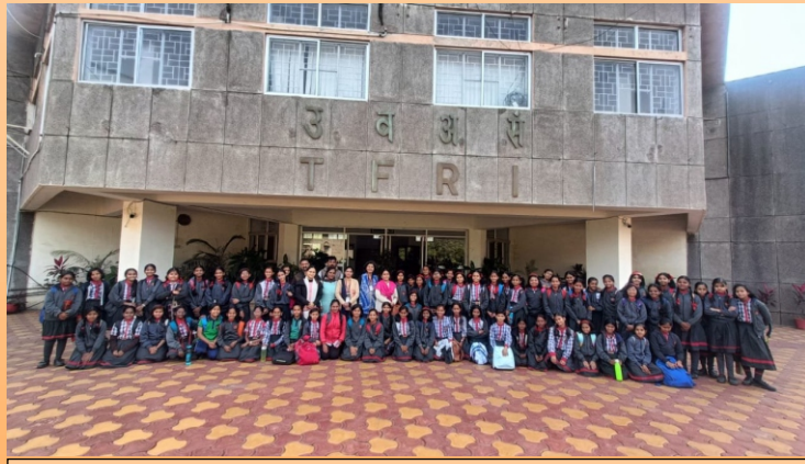
Visit of students from PM Shri Kendriya Vidyalaya No.1 GCF, Jabalpur to ICFRE-TFRI, Jabalpur