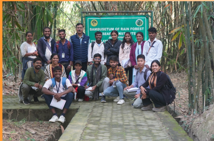
Visit of students from Bamboo Research and Training Centre, Chandrapur, Maharashtra to ICFRE-RFRI, Jorhat