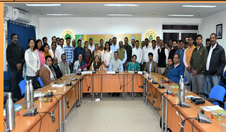
Training on “Quality Plant Production & Agroforestry Management for Livelihood Security ” by ICFRE-TFRI, Jabalpur