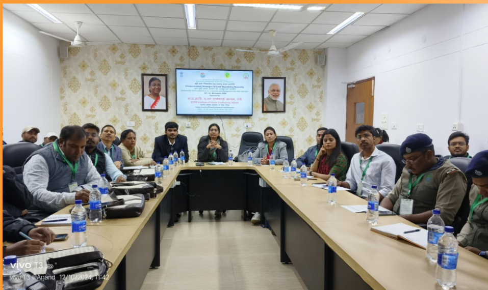
Regional training programme on “Sustainable Land Management” by ICFRE-IFP, Ranchi