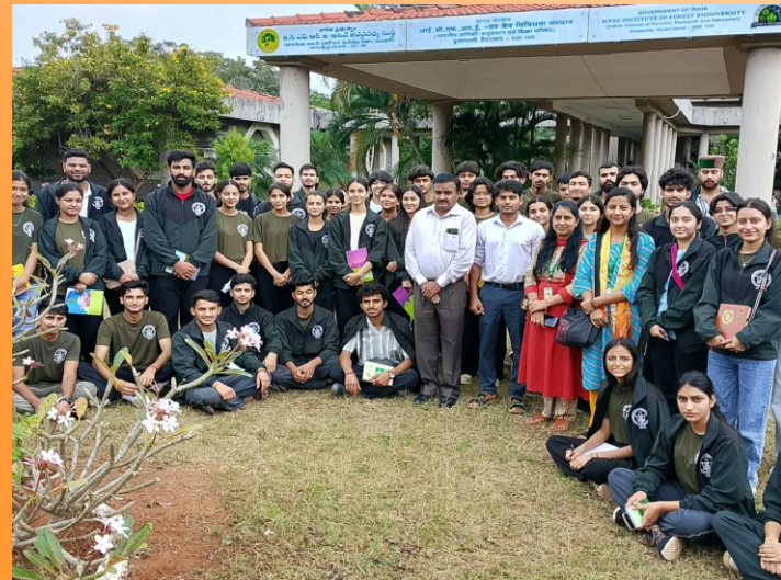
Visit of students from Dr. YS Parmar University of Horticulture & Forestry, Neri, Hamirpur (HP) to ICFRE-IFB, Hyderabad