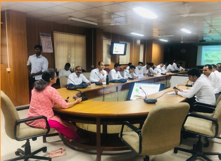
Officers from CASFOS, Coimbatore visited ICFRE-IFGTB, Coimbatore