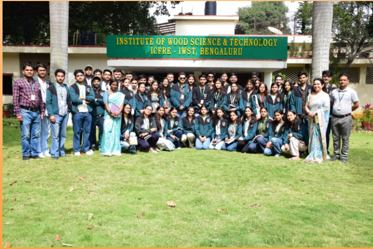
Visit of students from Dr YS Parmar University of Horticulture & Forestry, Nauni, Himachal Pradesh to ICFRE-IWST, Bengaluru

Wood Proper ties & Processing and Sandalwood Cultivation and its prospect.