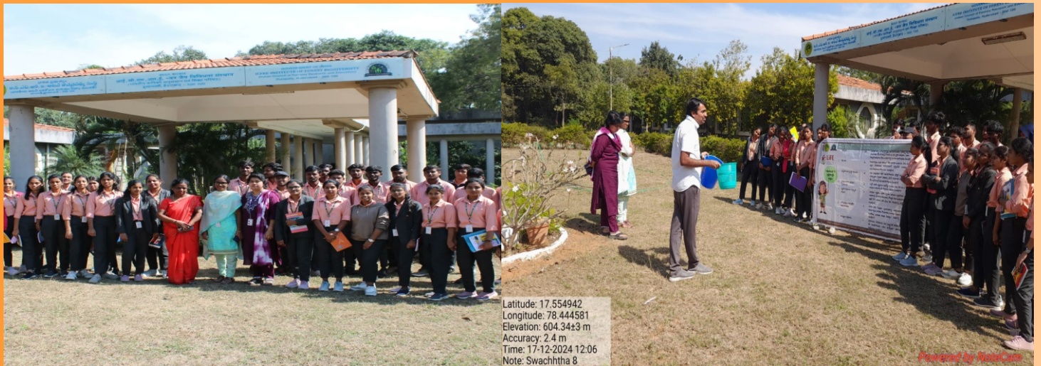
Visit of students from School of Agriculture Science, Malla Reddy University at ICFRE-IFB, Hyderabad