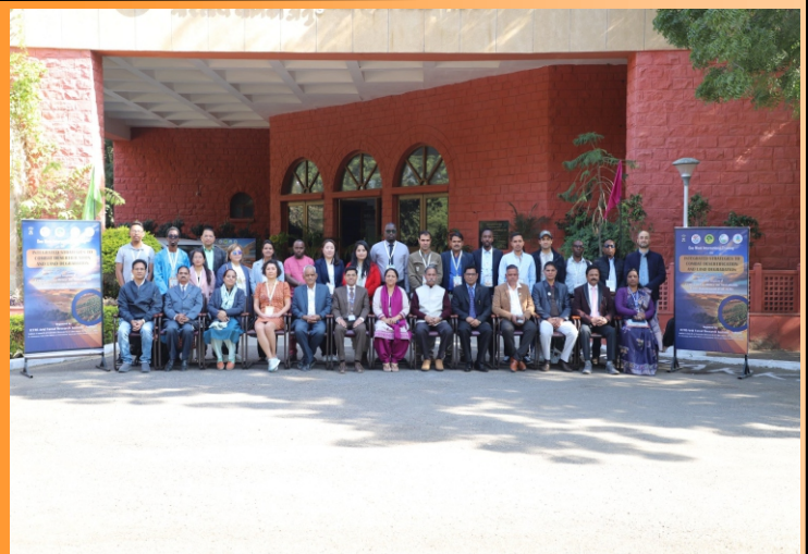
Training on “Integrated Strategies to Combat Desertification and Land Degradation ” by ICFRE-AFRI, Jodhpur