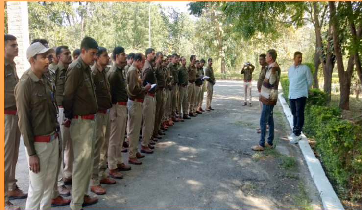
Forest Guards from Bikaner Forest Department and Forest Service Training Centre, Rajasthan visited ICFRE-AFRI, Jodhpur