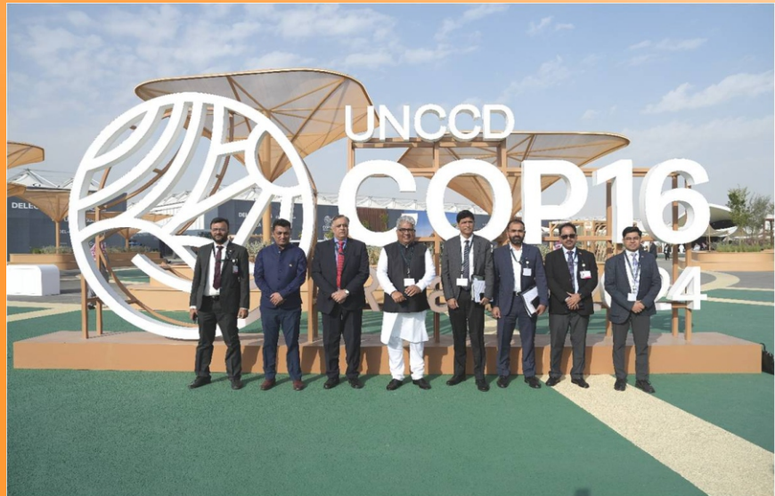
Shri Bhupender Yadav, Minister of Environment, Forest and Climate Change attended the UNCCD-COP16 in Riyadh, Saudi Arabia