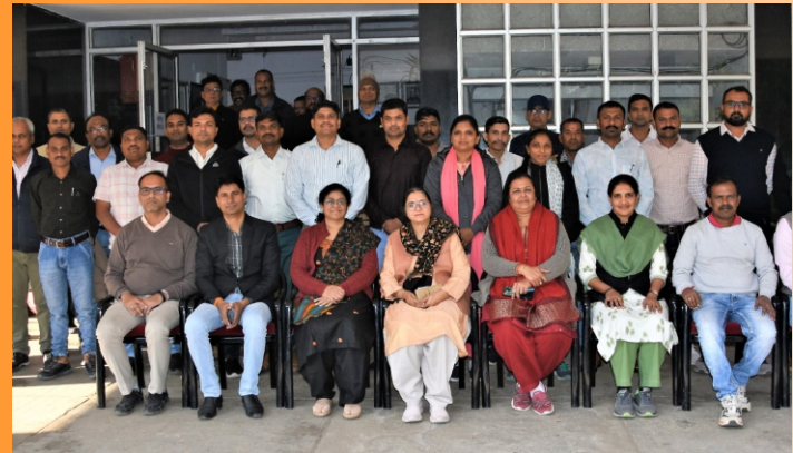
Officers from Gujrat Forest Department visited ICFRE-TFRI, Jabalpur