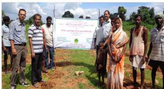
IFP, Ranchi inaugurated the Direct to Consumer project through plantation of Flemingia semialata

HFRI Shimla organized a meeting with the members of local Panchayat and progressive farmers under the "Direct to Consumer" scheme of the Council on 8 September 2012 at village Khatnol, tehsil Sunni, Distt. Shimla, Himachal Pradesh. During the meeting, scientists of the institute highlighted the relevance of the scheme to the participants with special reference to temperate medicinal plants cultivations especially Atish, Chora, Kutki etc. Similar Programme with the thrust on "Nursery Techniques of Atish and Chora – important temperate Medicinal Plants" under "Direct to Consumer" scheme was also conducted at vil age Khatnol of Distt. Shimla (HP) on 25 November 2012. About 25 participants attended this training programme.