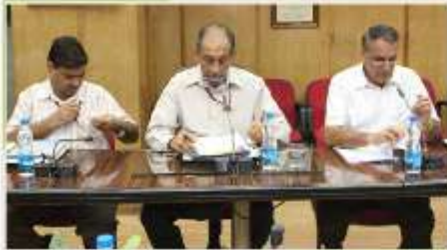
XLVI meeting of ICFRE BOG, held at MoEF, New Delhi