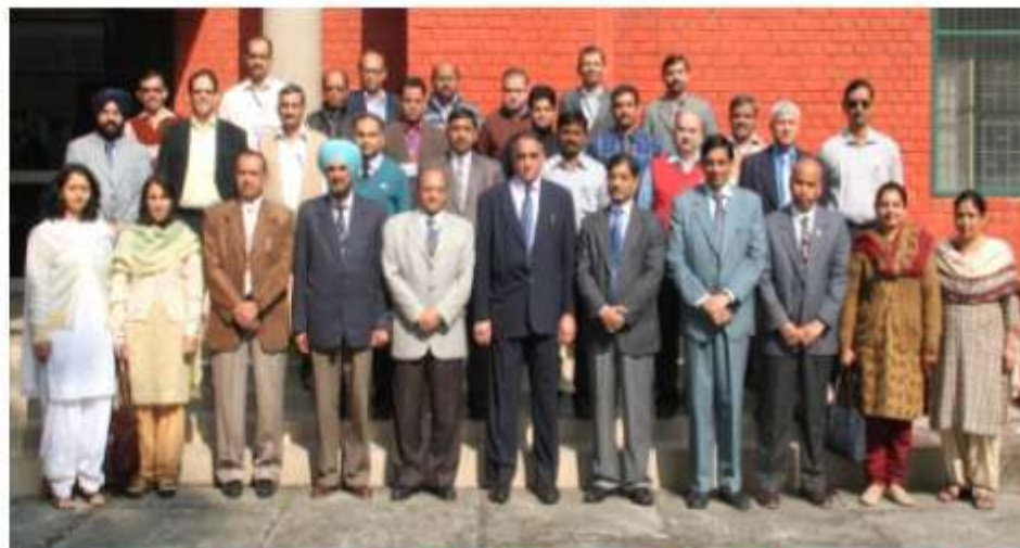
Participants and organizers of training workshop on "The Significance and Scope of REDD/REDD+ for India's Forests"

FRI, Dehradun organized a short-term training course on "Development of Green Belts"