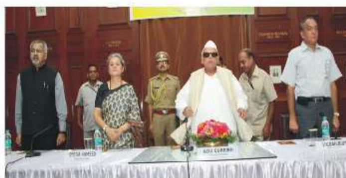
Dr. Aziz Qureshi, Hon'ble Governor, Uttarakhand in the Inaugural Session of workshop on "Sustainable Management and Livelihood Opportunities"