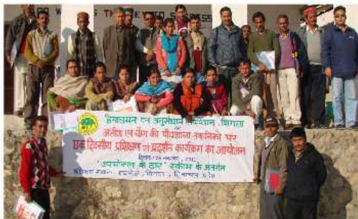
A meeting with the members of local Panchayat and progressive farmers under the 'Direct to Consumer' scheme at HFRI, Shimla