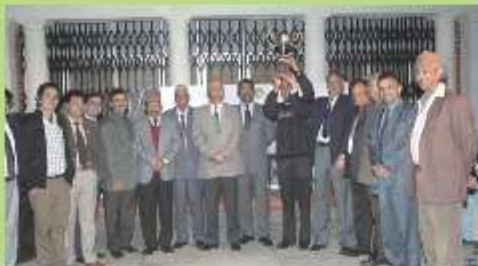
First "DG, ICFRE Invitational Golf Cup" at FRIMA Golf Course

First "DG, ICFRE Invitational Golf Cup" was organized at FRIMA Golf Course on 17 November 2012. As many as 79 golfers from Dehradun participated in the event.