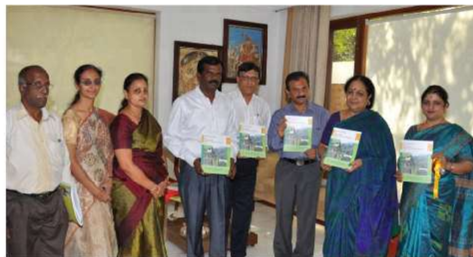
Smt. Jayanthi Natarajan, Hon'ble Minister releases the country report on the State of Forest Genetic Resources

The Institute of Forest Genetics and Tree Breeding (IFGTB), Coimbatore, through a national consultative process, has brought out the country report on the "State of Forest