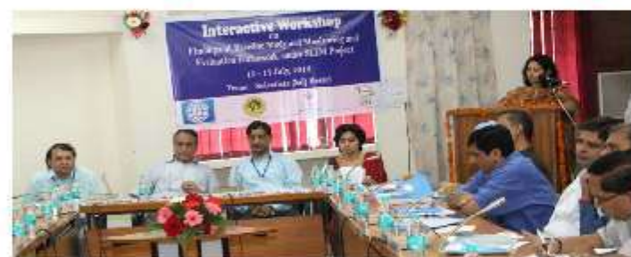
Interactive Workshop on "Findings of Baseline Study and Monitoring and Evaluation Framework" at ICFRE, Dehradun

ICFRE, Dehradun organised a two - day 'Interactive workshop on findings of the baseline study and monitoring and evaluation framework' under SLEM project on 16 and 17 July 2012. The workshop was attended by senior officers and experts from the Ministry of Environment and Forests, New Delhi, SLEM project partners, nodal officers of ICFRE institutes, NRM Division of ICAR, New Delhi, NRSC, Hyderabad, WII, Dehradun, SLUSI, New Delhi and officials of the World Bank. The two-day deliberations focused on findings of the baseline study on various thematic areas, viz. Land Management, Climate Change,