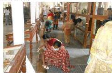
Cleaning of heritage site during Heritage Week 2012

programme at Gass Forest Museum was organised on 23 August 2012. About 30 students of Kumaraguru College of Engineering took part in the event.