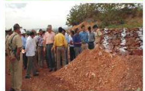
Study team inspecting mine affected areas in Bellary