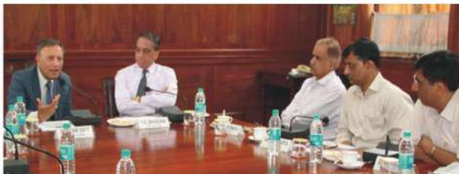
His Excellency Shri Shekhar Dutt, Hon'ble Governor, Chhattisgarh visited FRI, Dehradun

His Excellency Shri Shekhar Dutt , Hon'ble Governor, Chhattisgarh visited FRI on 9