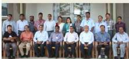
Training on "Scientific Methods of Lac Cultivation" at IFP, Ranchi

programme to popularize the temperate medicinal plants amongst masses in collaboration with Krishi Vigyan Kendra, Reckong Peo on 4 October 2012. The institute also organized two days training and demonstration programme on "Cultivation of Important Temperate Medicinal Plants - An Option for Diversification and Additional Income for Farmers" under the aegis of National Medicinal Plants Board, New Delhi, at Wildlife Interpretation Centre, Manali, District Kullu (HP) on 18 and 19 November 2012 in active collaboration with Krishi Vigyan Kendra (KVK), Bajura of Chaudhary Sarwan Kumar Himachal Pradesh Krishi Vishvavidyalaya (CSKHPKV), Palampur (HP). Approximately 50 participants along with resource persons were present during the training programme.