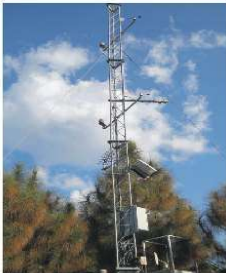
Forest Meteorological Station (FMS) tower at FRI, Dehradun

Soil samples for physio-chemical properties in different locations of each micro-watershed were also collected. About 800 water samples were collected to measure suspended load from each micro-watershed. Infiltration tests at four locations of each micro-watershed were done through double ring infiltrometer and interpretation of infiltration rate has been completed. About 5000 water and precipitation samples have been collected for isotopic and tritium analysis at NIH Roorkee. Annual budgeting of rainfall and runoff for three years has been done to indicate the relation of hydrology with forests.