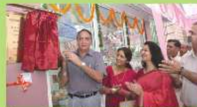
Inauguration of Souvenir Shop at FRI Campus

ICFRE has come up with a novel concept for helping the tribals and forest based artisans through creation of PRERNA Souvenir Shop, a platform for marketing their products.