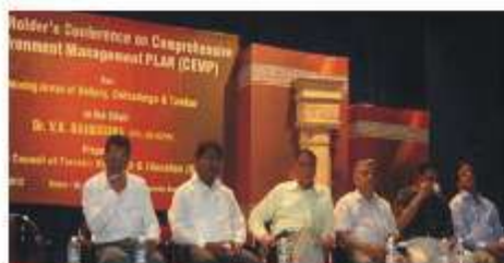
View of stakeholders meet held under the chairmanship of DG, ICFRE

ICFRE organized a series of stakeholders meets at Bellary, Chitradurga and Tumkur districts with different stakeholders for preparation of "Comprehensive Environmental Management Plans for the Mining Impact Zone" (CEPMIZ) of these districts. The