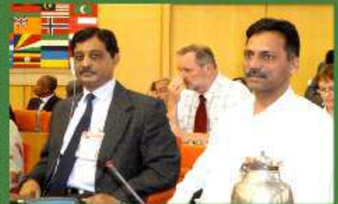
Shri Saibal Dasgupta, DDG (Ext.) and Shri Pankaj Aggarwal, ADG (EM) at COFO 2012