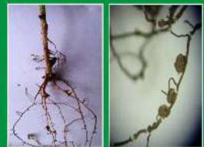
Nodulation in the rooted stem cuttings of A. auriculiformis due to Rhizobium inoculation

have not shown the root nodules as they propagated in vermiculite. At IFGTB, an attempt has been made to establish root nodules in the rooted stem cuttings of A. auriculiformis by inoculation of cultured Rhizobium. The root nodules have emerged in the lateral roots by splitting of root cortex in the rooted stem cutting of A. auriculiformis after 30 days of inoculation.