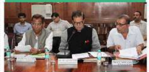
Parliamentary Committee on Science and Technology, Environment & Forests at FRI, Dehradun

Parliamentary Committee on Science and Technology, Environment & Forests visited FRI, Dehradun on 4 July 2012. Committee headed by Dr. T. Subbarami Reddy appreciated the efforts of ICFRE in the field of forestry research, education and