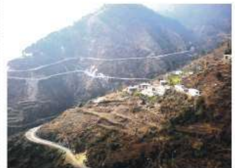
Degraded micro water shed at Bansigarh