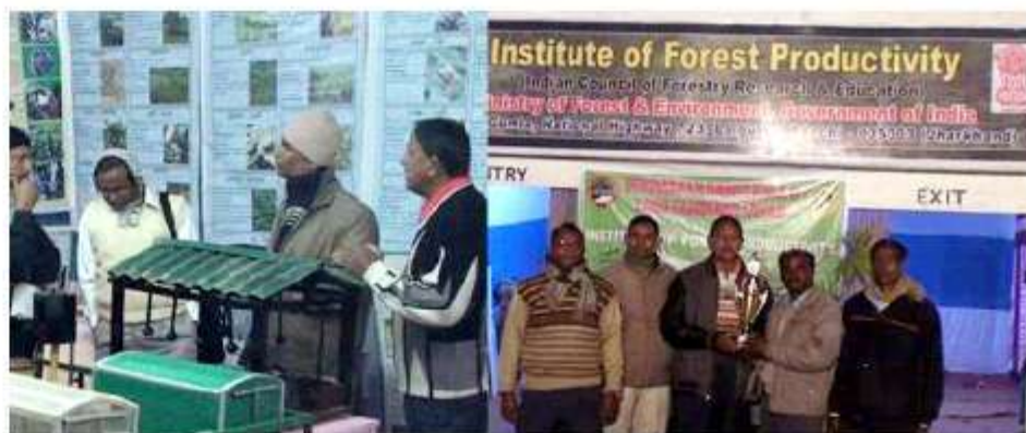
IFP, Ranchi stall at 17th Rural Exhibition-cum-Fair Sunderban Kristi Mela – O - Loko Sanskriti Utsab

Monitoring and Evaluation Division under the Directorate of Research deals with the annual review and evaluation of all the ongoing research projects of ICFRE institutes. It suggests corrective measures for timely completion of the projects and achievements of the objectives with perfection. During July - December,