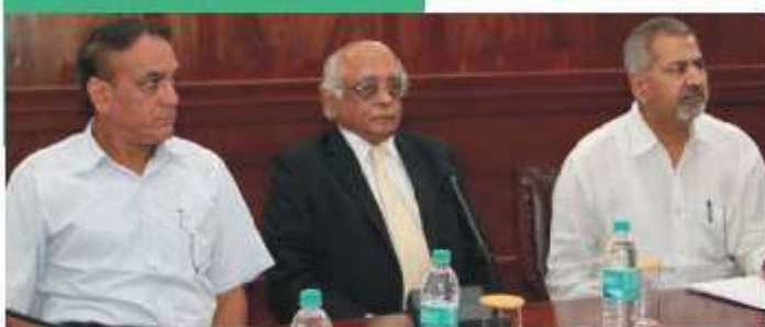
Dr. R. Chidambaram, Former Director of BARC, Principal Scientific Advisor to Govt. of India and Chairman of the Scientific Advisory Committee to the Cabinet visited FRI, Dehradun

extension towards meeting the livelihood needs of the people living in forest fringe areas and also focusing on emerging issues of biodiversity conservation and climate change. Chairman of the committee has written letters to the Hon'ble Prime Minister, Hon'ble Forest Minister and Chairman Planning Commission regarding the recent initiatives by ICFRE and requesting for additional allotment of budget to take forestry research to higher levels.