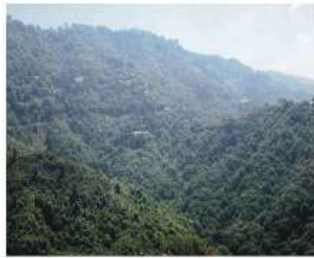
Dense micro water shed at Arnigad

a young pine plantation through Forest Meteorological Station (FMS) tower at experimental area of FRI, Dehradun. The period covered two active growth phases of pine in different rainfall regime and with (year 2010) and without (year 2011) clearing of understorey species. This study reports for the first time the dynamics of micrometeorological behavior and highly variable response of energy and water balances in a growing chir pine system in western Himalayas and the role of management of understorey species from two years of observations.