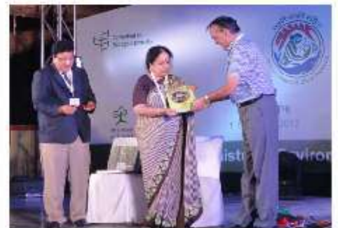
Smt. Jayanthi Natarajan, Hon'ble Minister releases "Forest Biodiversity in India" and "Forest Sector Report India 2010"

The report covers six important sub sectors associated with forestry name y Forest Management and Community Participation; Conservation of Forests,