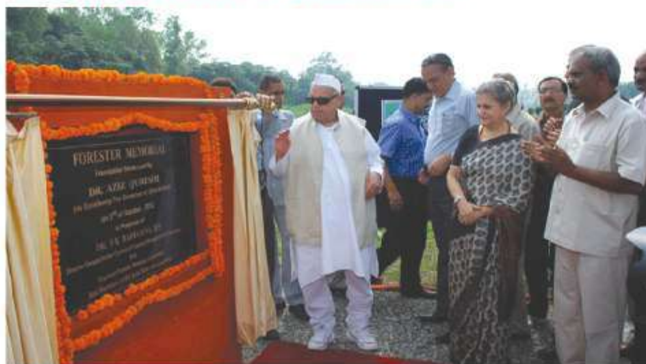
Dr. Aziz Qureshi, H.E. Governor of Uttarakhand and other dignitaries at Foundation Stone of "Foresters Memorial" at FRI

History of scientific forestry in India has a long list of eminent foresters who contributed and sacrificed a lot in the development of scientific forestry in the country. A Memorial is planned to be erected at FRI, Dehradun. Foundation Stone of "Foresters Memorial" at FRI was laid by Dr. Aziz Qureshi, Hon'ble Governor of Uttarakhand on 3 October 2012 and the construction work is in progress.